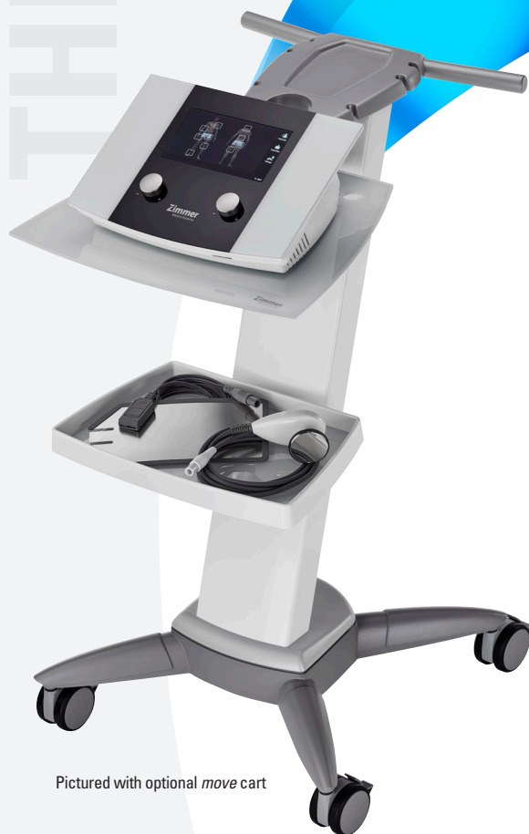
Pictured with optional move cart