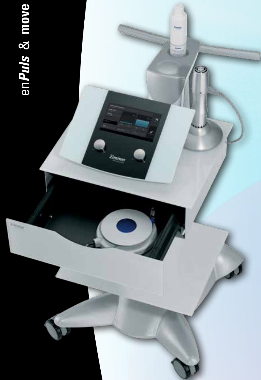
enPuls 2.0 shown with optional move cart and hand piece holder