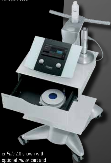
en Puls 2.0 shown with optional move cart and hand piece holder

Zimmer MedizinSystems 3 Goodyear, Suite B Irvine, CA 92618 Phone: (800) 327-3576 info@zimmerusa.com www.zimmerusa.com shop.zimmerusa.com