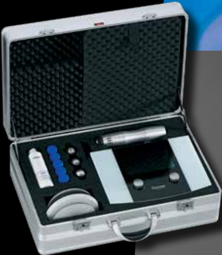
en Puls 2.0 shown with optional aluminum transport case